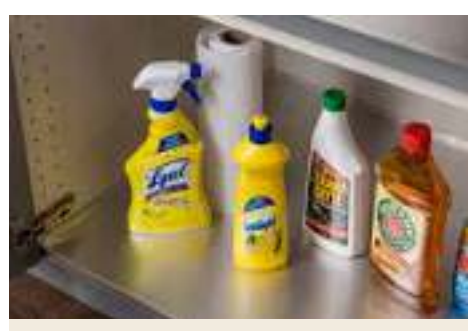
UNDER SINK MAT