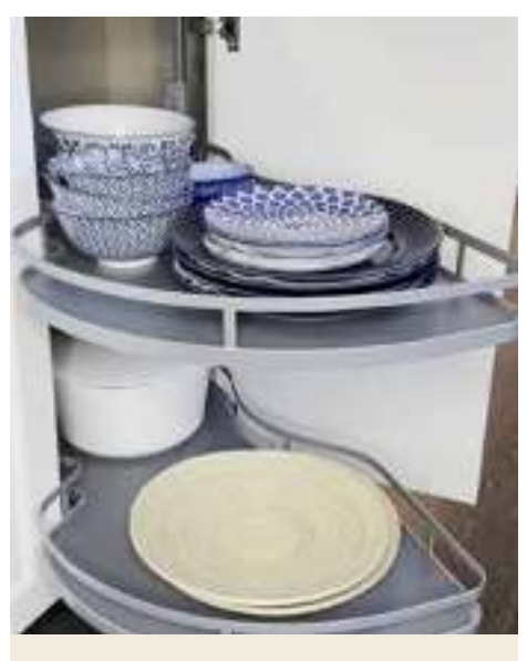
LEMANS PREMIUM CORNER PULL-OUT