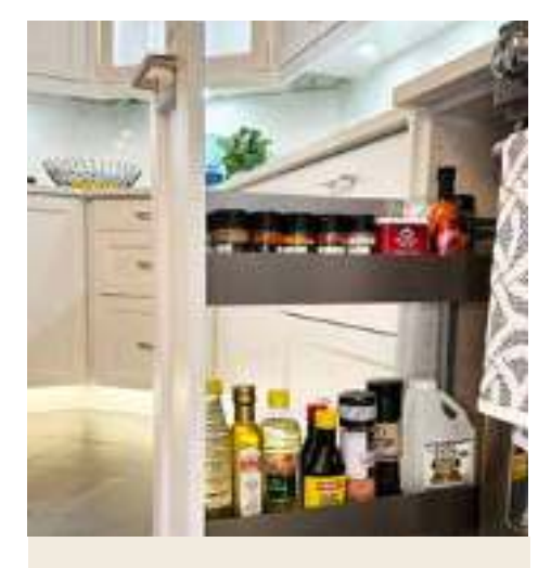
SPICE RACK PULL-OUT