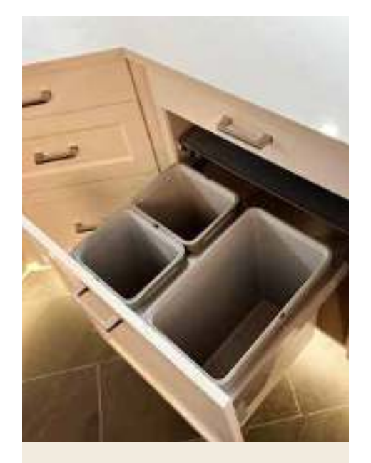
PULL-OUT RECYCLING/ TRASH BINS