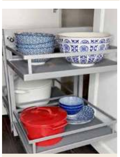
MAGIC CORNER PULL-OUT