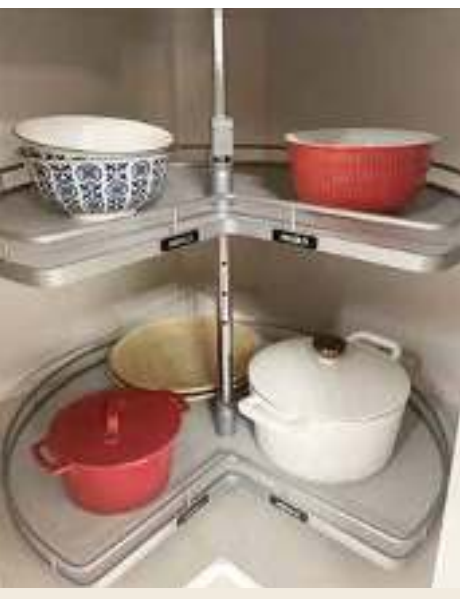
PREMIUM LAZY SUSAN