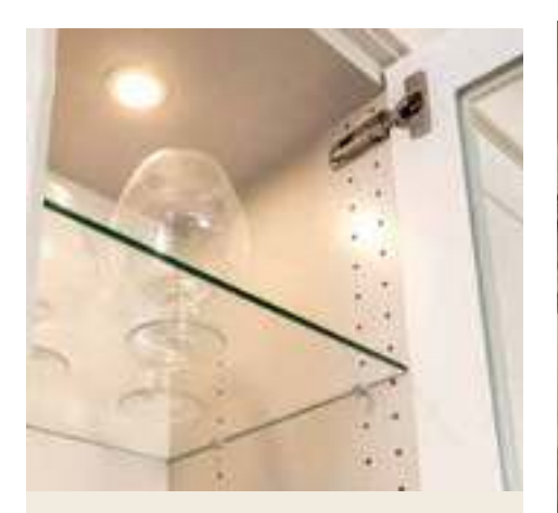
GLASS DOORS & GLASS SHELVES

Add smart storage solutions that keep your items off the counter, organized, and stylish. Top things off with our chic colour-matched panels, mouldings, and trims for the perfect finishing touch.