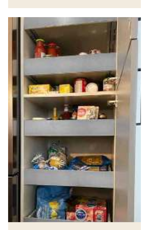
HIDDEN DRAWERS / ROLL-OUT TRAYS